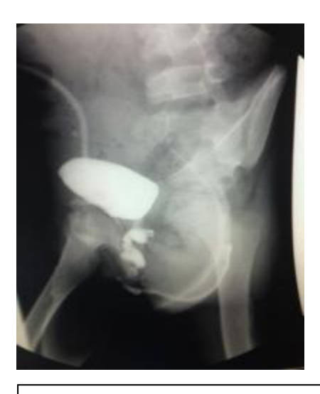
Picture 1 showing pelvic fracture in case 4 on left and post op cystogram after Monti reconstruction of urethra on the right